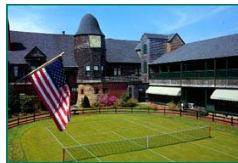
International Tennis Hall of Fame

After tennis on Friday evening, everyone enjoyed a relaxing dinner party held at Johnnie's Atlantic Beach Club and Pavilion in nearby Middletown. A three piece band and vocalist provided the evening's entertainment. Complete proceedings have been posted to our website at http://www.northinfo.com/papers .