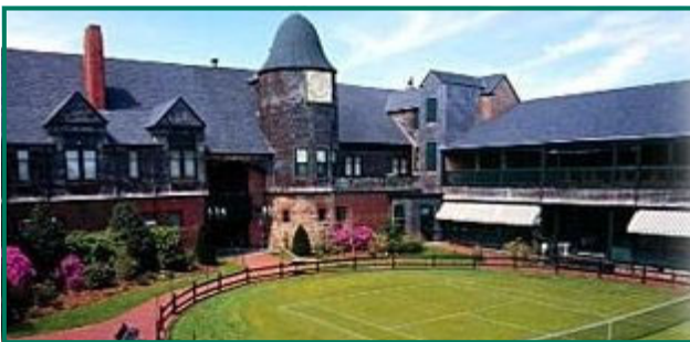
International Tennis Hall of Fame

Tennis Hall of Fame • Newport, Rhode Island • June 4, 2004